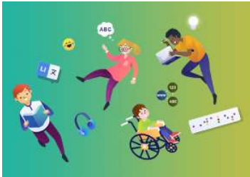
Language, Literacy and Communication

Six 'Areas of Learning and Experience' (AOLE's) help school achieve the four purposes, that span the entire age range from 3 to 16. They promote and underpin continuity and progression, and encourage teachers to work creatively and collaboratively across traditional subject boundaries.