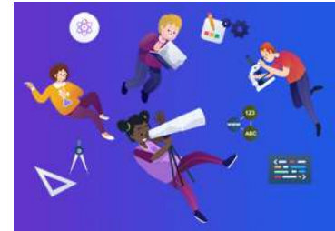
Science and Technology