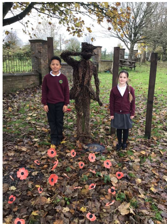
Monkhouse Schoolwear Specialist in Mold stock our sweatshirts.

For PE Lessons the pupils wear their kit to school instead of getting changed during the day. The kit that your child needs will vary with the seasons.