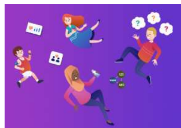
Health and Wellbeing