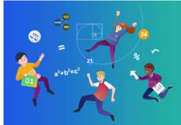
Maths and Numeracy